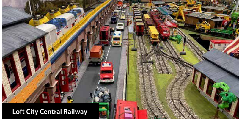
Loft City Central Railway