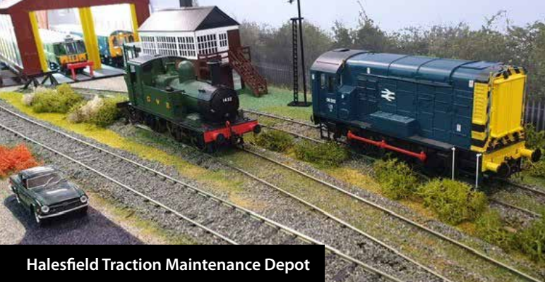
Halesfield Traction Maintenance Depot